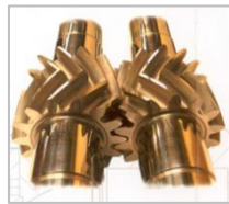
Superior Herringbone Gears