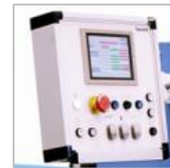
8" Touch Screen interface with 2000 product database