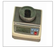
Weigh Scale loop system